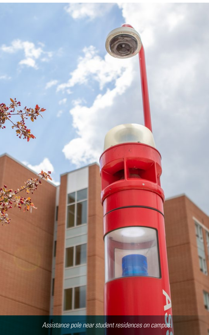
Assistance pole near student residences on campus.

As part of maintaining McMaster's emergency systems to ensure they are operating at the highest standard, the systems are fully activated at least twice annually. In addition to these regular tests, all McMaster Security Services staff are trained on the use of all these systems and partake in weekly testing to ensure complete knowledge of its use.